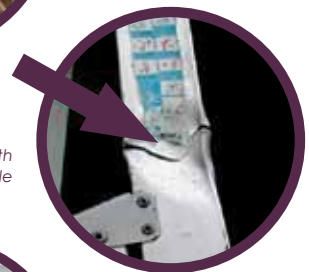
Ladder with damaged stile