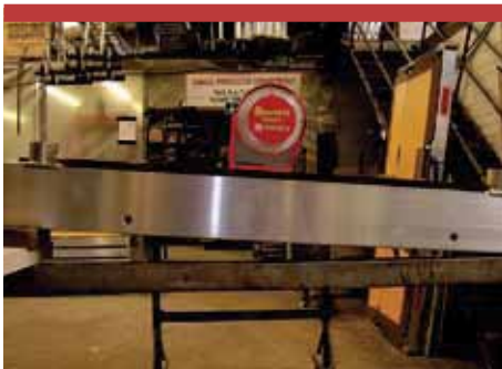
Easidec Deck for overbalancing limits