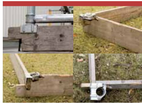
Toe Board clip