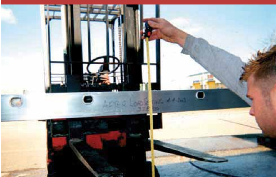
Testing Easidec Catwalk for Safe Working Load