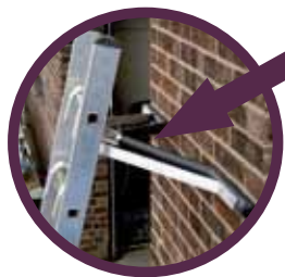
Easi-Dec stand off

Only Class 1 or BSEN 131 ladders should be used; domestic ladders, with a red label are Class 3 and are not suitable for commercial work.