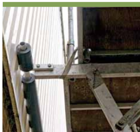
Where platforms narrow or gaps increase, adequate protection against falling must be provided