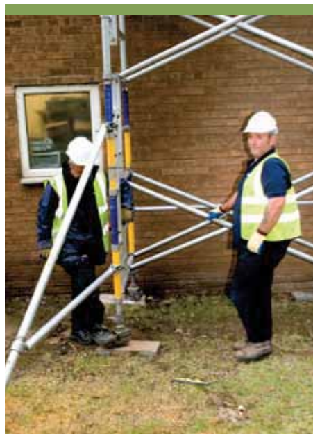
Check Brakes are applied

For enhanced safety, the mobile tower could be physically tied into the property, however it must be tied in at all times when the required height/base ratio cannot be achieved due to lack of ground space for the fitting of outriggers/stabilisers. The use of strong chains, wire cable or tubing attached to fixing anchors, or the fitting of tubing to through ties, is required in such instances. At no time must fixings such as ropes be attached to downpipes or similar weak structures.