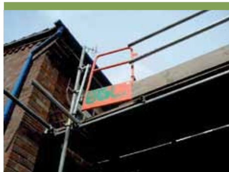
Access Gate to Platform