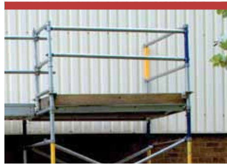
Mobile Tower Scaffold